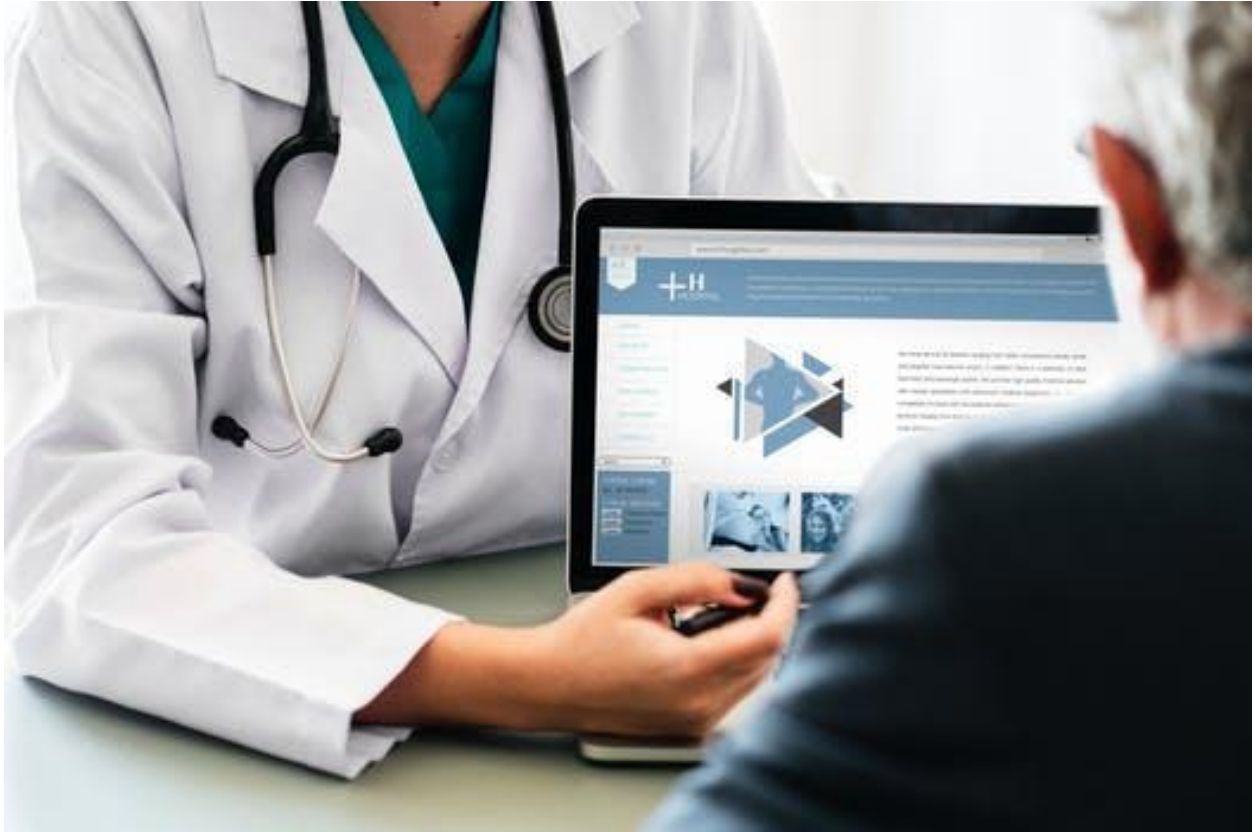
Health Services Manager