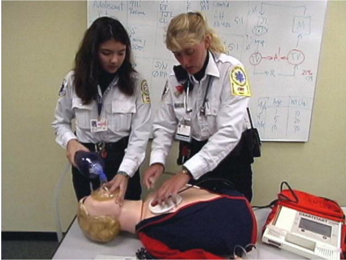
Emergency Medical Technician