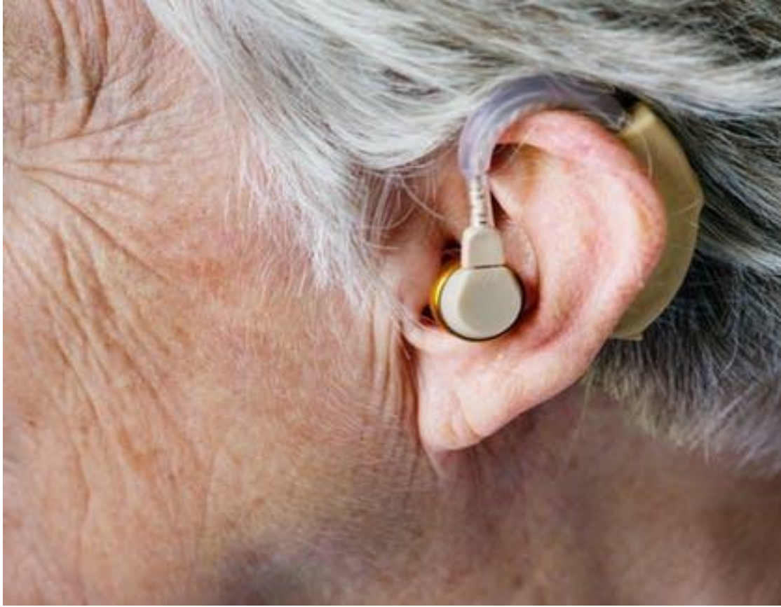
Speech & Language Pathologist