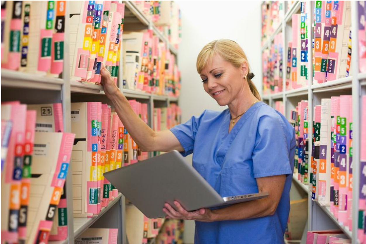
Medical and Health Records Technician